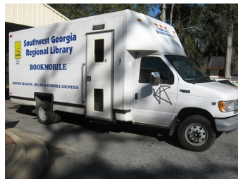
Visit the Bookmobile for the latest and greatest books, DVDs, and more!