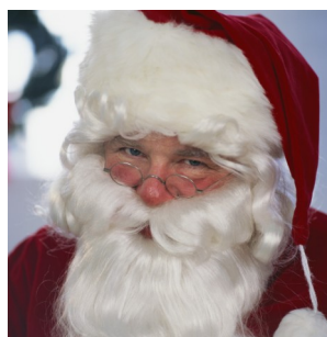
Reserve your child's spot to meet Santa!

Ameris Bank, First State Bank, and People South Bank. The Georgia Rural Library Initiative Grant is sponsoring Breakfast with Santa at the Seminole County Public Library.