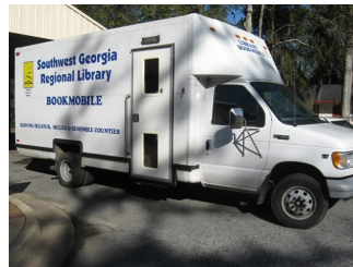
Visit the Bookmobile for the latest and greatest books, DVDs, and more!

Please call 229.248.2665 for more information on how to set up a Bookmobile stop near you.