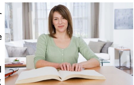
Learn the concepts of marketing on Tuesday, November 8, 2011 from 1-3 p.m.!