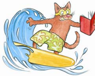
Register your child for the Vacation Reading Program beginning Monday, May 17, 2010!

Don't miss out on the most exciting Vacation Reading Program yet!