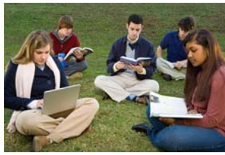
Find resources to obtain college scholarships at your library!

Researching and applying for scholarships is on the mind of many high school students and parents. Scholarships are excellent ways to help fund a college education. There are many scholarships available, and the library is here to help you with the resources you need to find available scholarships. The library has many books to help, including Scholarships for African-American Students , 501 Ways