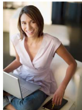
Learn how to use a computer with ease at the Decatur County—Gilbert H. Gragg Library this month!

at 10 a.m. at the Decatur County—Gilbert H. Gragg Library. Space is limited; please call the Decatur County—Gilbert H. Gragg Library at 229.248.2665 to reserve your spot today!