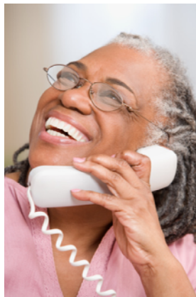
Use Newsline to listen to the headlines of your favorite newspapers!

Physically Handicapped at 1.800.795.2680 or 229.248.2680 to sign up for the Newsline service.