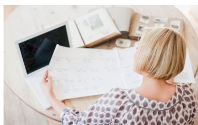
Investigate your ancestry at the Seminole County Public Library!

Seminole County Public Library for an informative genealogy session.