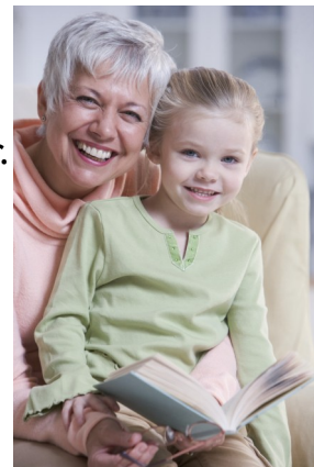
Give the gift that the entire community can enjoy!

can send a check so the library can order the item. This is a great gift idea for that person in your life who is difficult to buy for. Each book will have a special bookplate inserted recognizing your loved one. You