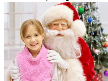
Don't miss the chance for your child to visit Santa at the library!

Saturday, December 10, 2011 for three sittings, which are at 9 a.m., 10 a.m., and 11 a.m. Space is already filled for this program, which is sponsored by First Port City Bank and is suitable for children up to age 9.