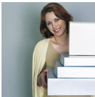
Buy something for that special someone in your life this holiday season from the library!