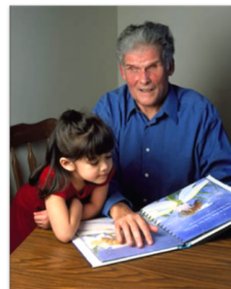
Introducing the Southwest Georgia Library for Accessible Services!

Southwest Georgia Library for Accessible Services