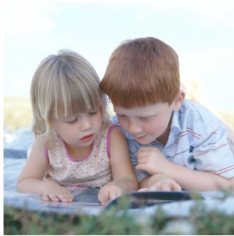
Storytimes at your library resume this August! Bring your little one for stories, songs, games, crafts, and a whole lot more!